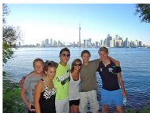
Exchange students at U of T