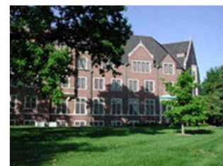
Windsor Halls Residence